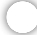
Frozen White Solid body colour